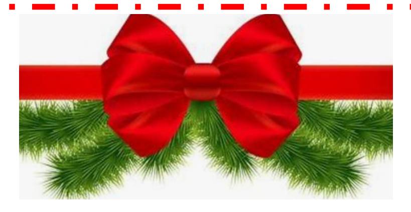
Cherry Court Initiation December 11, 2024 – 7:00 p.m.